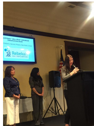
Rebekah Children's Services

The evening's big winners were the recipients of the Julie Hayes "Rising Star" Performing Arts Competitive Grant ($20,000 was awarded to the GHS Band) and the Richard Hayes "Like a Rock" Industrial Arts Competitive Grant ($20,000 was awarded to Rebekah Children's Services.)